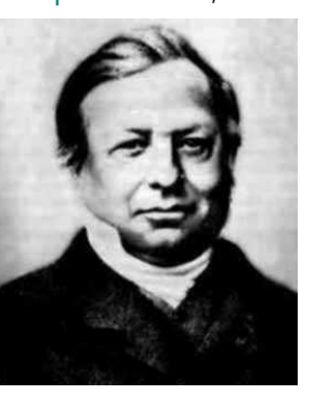
Joseph Liouville, 1844