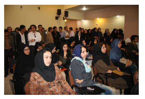
Institute for Advanced Studies in Basic Sciences, Zanjan (Iran)