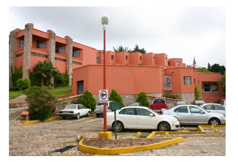
Centro de Investigación en Matemáticas Guanajuato (Mexico)